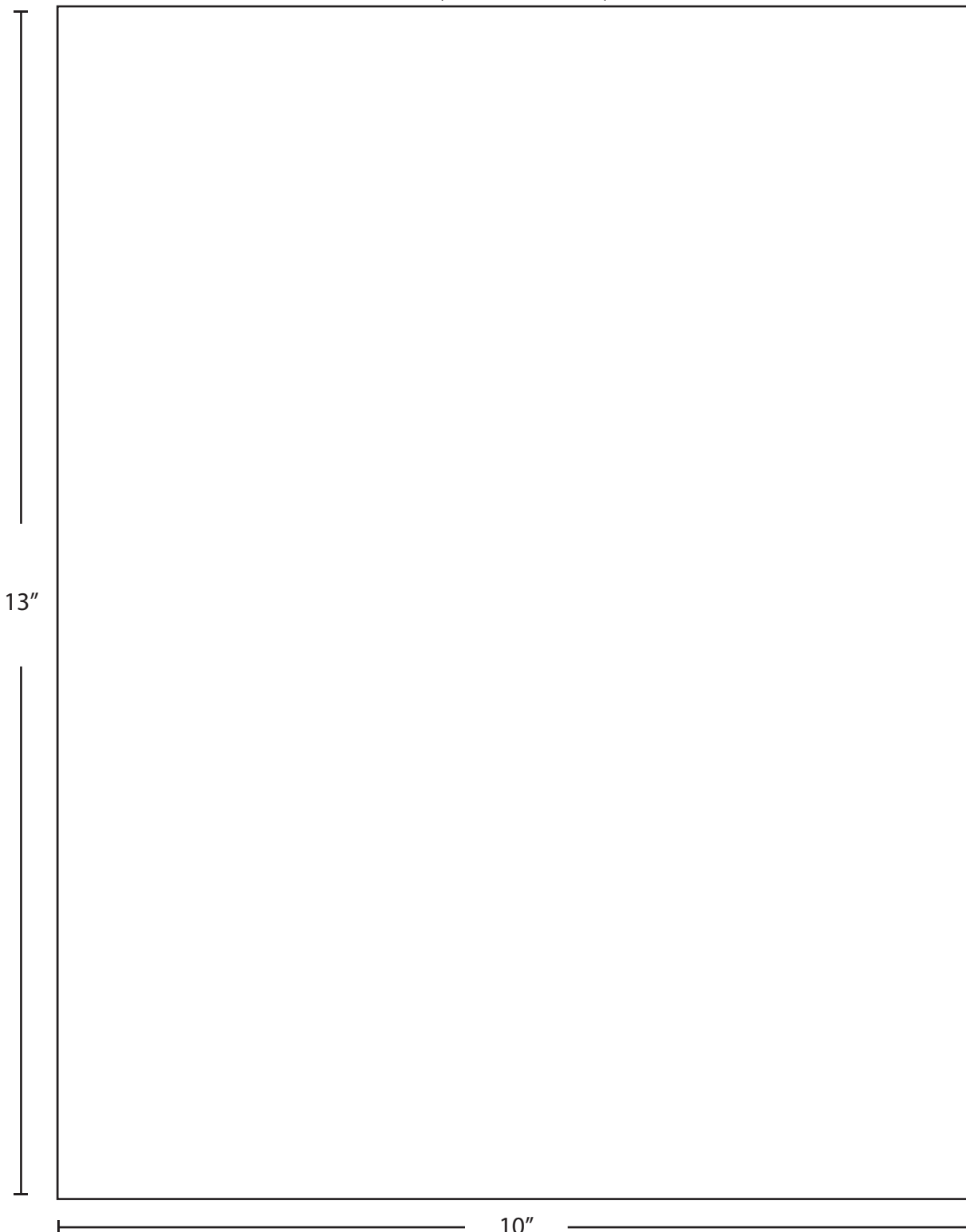
FRONT SIDE (GLUED FLAP ON BACK)